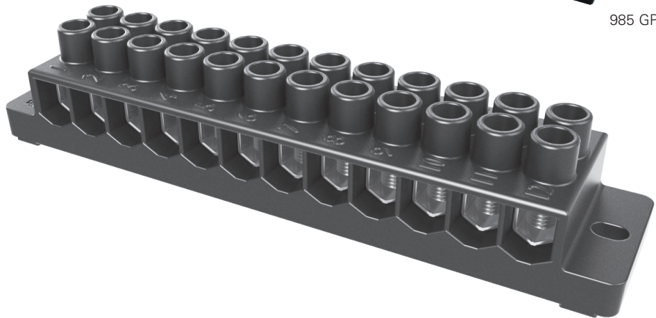
885 RZ 12